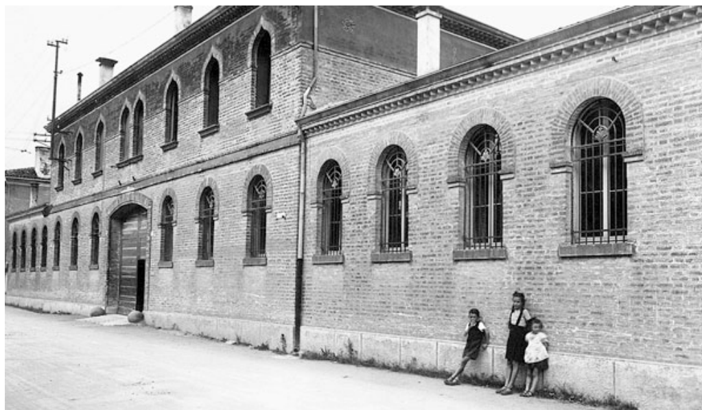
Acca Kappa company in 1869