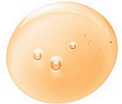
Jojoba Seed Oil